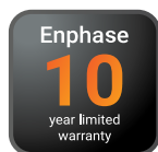
10-year limited warranty